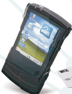
WF35 with MSR