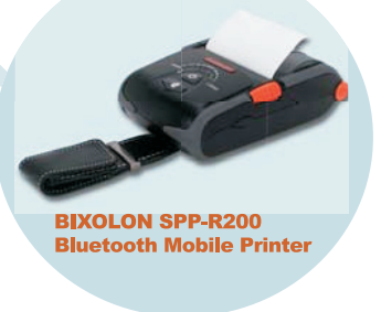
BIXOLON SPP-R200 Bluetooth Mobile Printer

Industrial specific features, e.g. drop tested, MSR, Bluetooth, vibrator, signal lighting, strap.